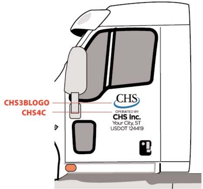
CHS4C* DOOR DECAL - Your City, State