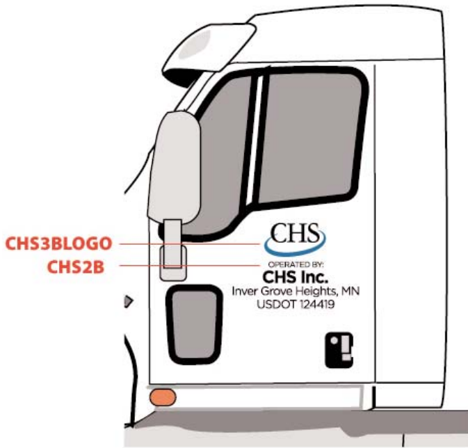
CHS2B* DOOR DECAL